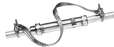
XJG shown with optional bonding jumper Bonding jumper width: 0.188"; height: 0.875"